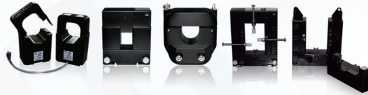
Split-core current transformers, transducers and current detecting modules