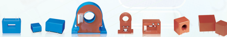
Hall-effect voltage and current sensors, and DC leakage current sensors

We're an exclusive exporter of high-precision current sensors, the core components used in the power instrument industry. If you need customizations, we have the capabilities to cater to your requirements accurately and promptly.